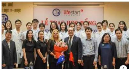
EN.VIETNAMPLUS.VN Scholarships presented to disadvantaged students in central Vietnam

Lifestart Foundation xin chân thành cảm ơn Báo Quảng Nam đã đưa tin về sự kiện quan trọng này của tổ chức.